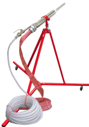
Photo shown complete assembled Stromme tripod with Combi spray gun together with couplings, air and water hoses.

Place the Y-Piece (1) on the floor with the tripod location hole uppermost. Insert the legs (2) with the 9 mm holes at the end of the legs nearest the Y-Piece and with the tripod location holes uppermost. Secure using two of the 8 mm pins (3) and close the retaining clips. Insert the tripod legs one at a time into the location hole and secure with the 8 mm pin, close the retaining clip.